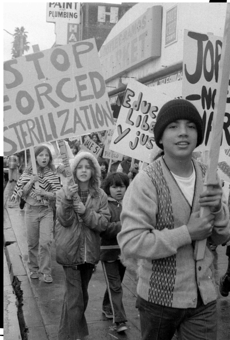
Left: Young marchers protest the forced sterilization of Latina women, 1971. Right: ICI Saskatchewan, 2019