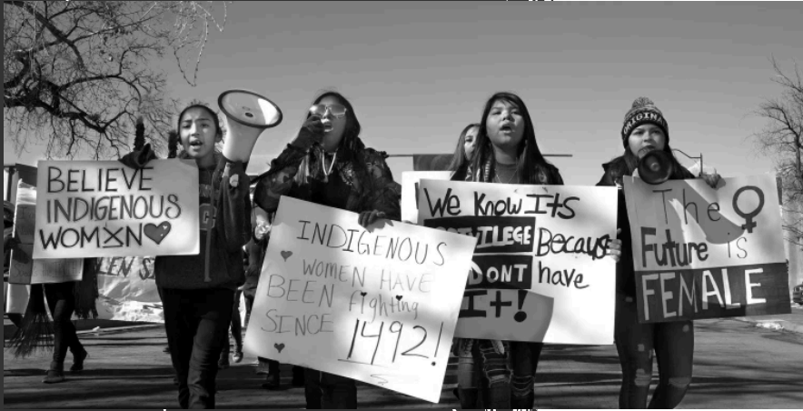
Native American girls march in Santa Fe, N.M., on Jan. 19, 2019.

Forced sterilization was an attack on bodily autonomy and part of a huge eugenics effort rooted in white supremacy. While we're going to focus on the forced sterilization of Indigenous people here, it should be noted that many "undesirable" groups of people were targets of these efforts, including Black, Latino, and disabled communities. PBS has an article about it entitled "Unwanted Sterilization and Eugenics Programs in the United States" from 2016, should you want to read further.