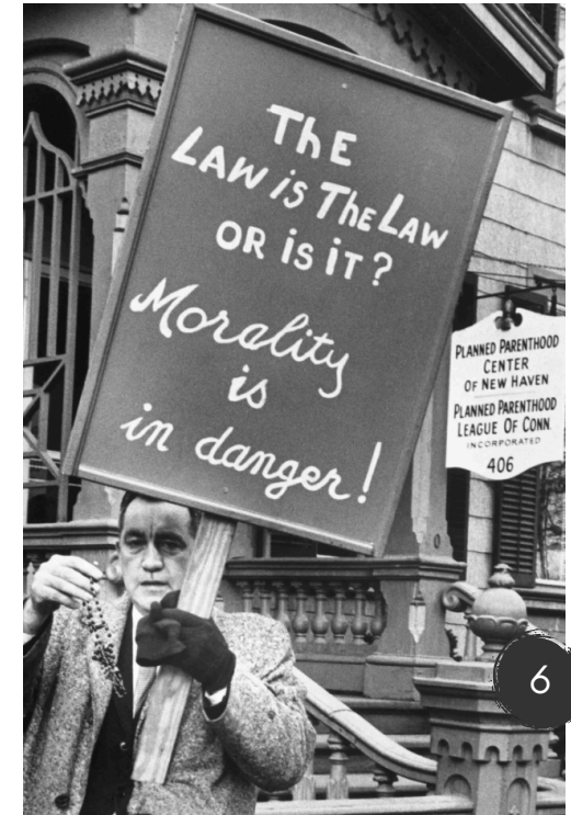
Left: An anti-birth-control demonstrator outside a new Planned Parenthood center in New Haven, Conn., in 1963.

In response, many groups got to organizing. It's worth researching the origins of the National Medical Association, as they are the largest and oldest organization representing Black doctors and Black patients. In this zine, we're more focused on the women across the country who started the fight for abortion rights. Planned Parenthood is famous for their work in reproductive healthcare, so it shouldn't be a surprise that it was founded in the midst of that early organizing in 1916. This comes right after the women's suffrage movement was coming to a close.